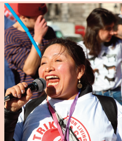
Above: RMT Tube cleaners teamed up with outsourced workers from three other unions - IWGB, UVW, and PCS - on 26 February, for a demonstration against outsourcing.

Unless you're fluent in the lingo of "card clash" and "contactless", it's likely to go over your head.