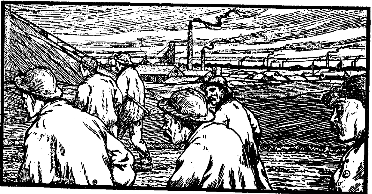
Miners going to work at the end of the century in the Borinaoe.

(22) "An Hour before the Decision" in Leipziger Volkszeitung no. 88, 18th April 1902.