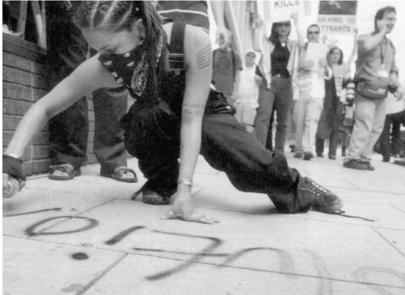
Anti-IMF protest, Washington

Iraqi oil industry developed by multinational consortia involving French, Russian and Chinese firms alongside the US and British giants, and maybe to make special provision for Iraq's debts to Russia (about $12 billion) to be given priority over other debts.