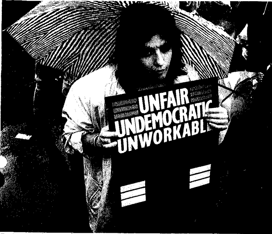
Teachers on strike against 'Poll capping' Bristol, June 1990.