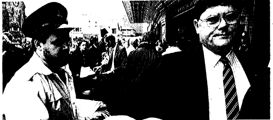
Ambulance drivers leaflet Tory Party Conference.

The unions' PR efforts were, in fact, aimed more at their own members than at the general public, and the employers (in the words of the Financial Times ) "scoffed" at the threat of strike action. Support for the campaign was under-