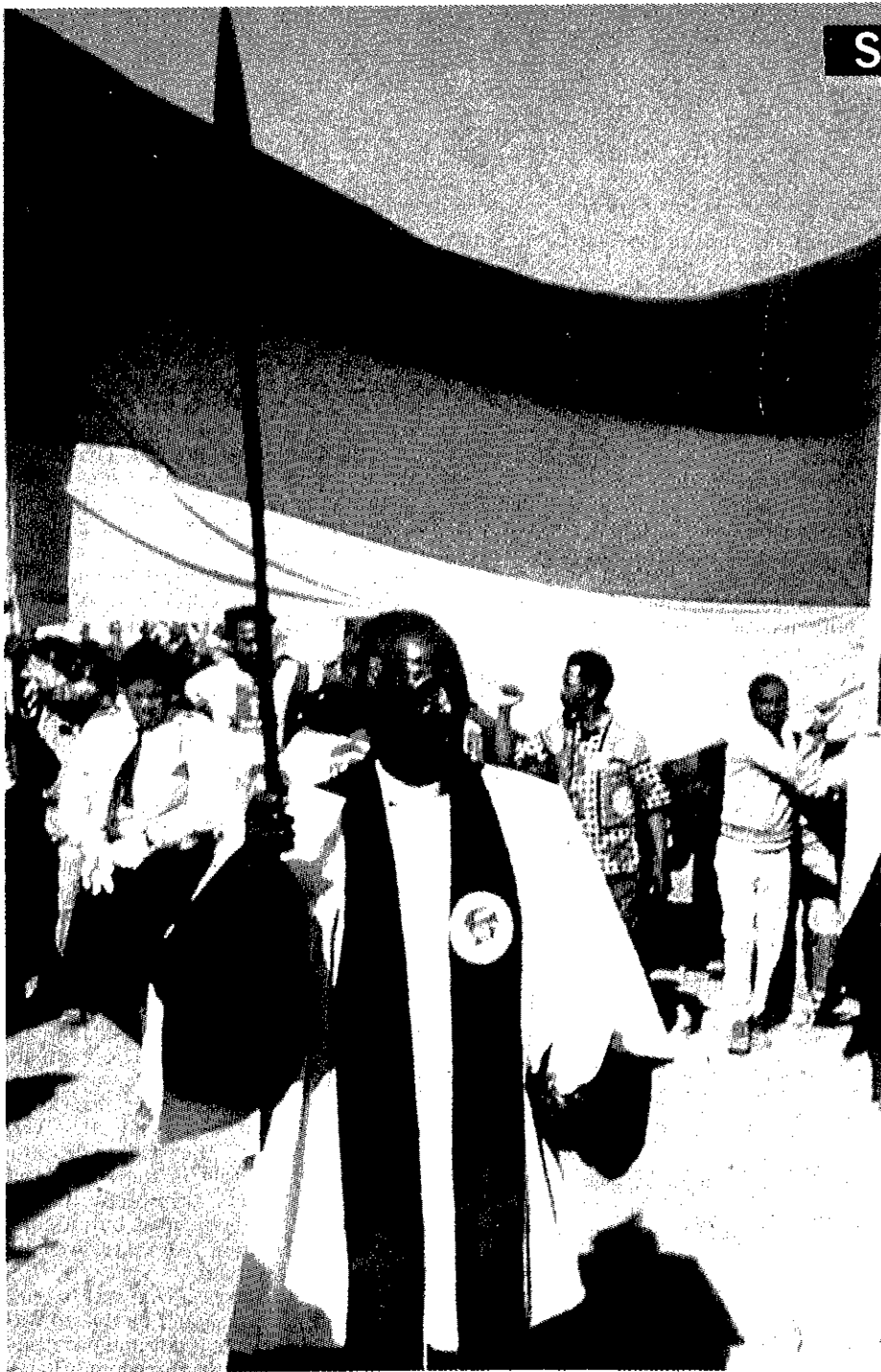
The flag of the ANC