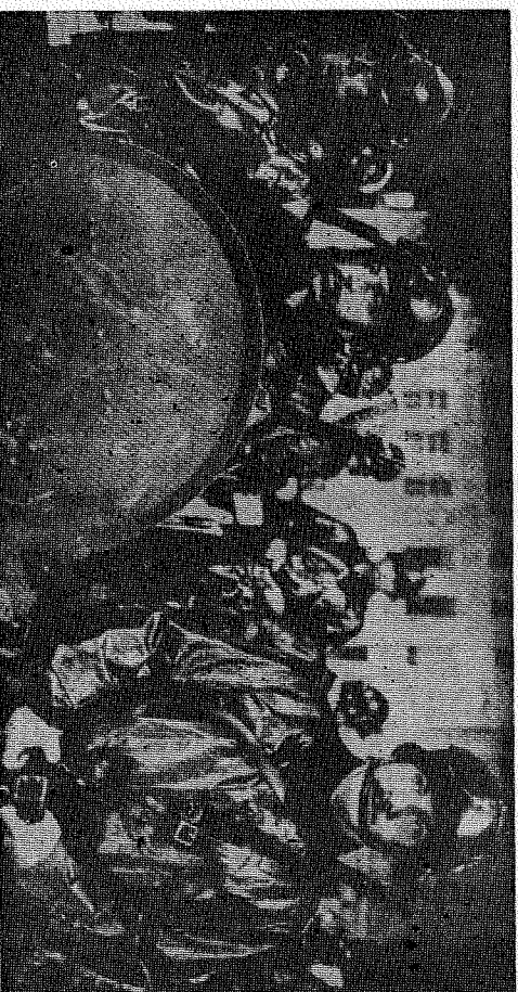
The para-military C.R.S. prepare for action against the revolutionary workers and students of Paris

The events of the month of May in France were a powerful demonstration of the revolutionary might of the working class; a demonstration without equal in our time. At peak over ten million workers were on strike. Factories, transport, mines, docks, shipyards, hotels, ships at sea, etc., flew the red flag as the workers took over. Electricity supplies were cut off