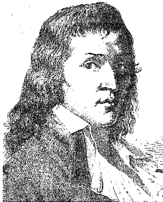
Gracchus Babeuf, leader of the 'Conspiracy of Equals', the "last act" of the Great French Revolution. From 'The Left in Europe'.